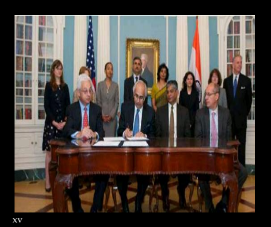
Chairman CCI signing India-US MOU on Anti-trust cooperation with US agencies

As far as India is considered, Competition Law in the past couple years has been operating effectively and has helped promoting fair competition participating in various workshops organized by international bodies like Training on competition law and state-owned enterprises which was held on 21st may 2012 and on handling in-depth Training merger investigation, held on 23rd Collaboration 2012. with foreign regulatory bodies is other outstanding initiative of the Commission.